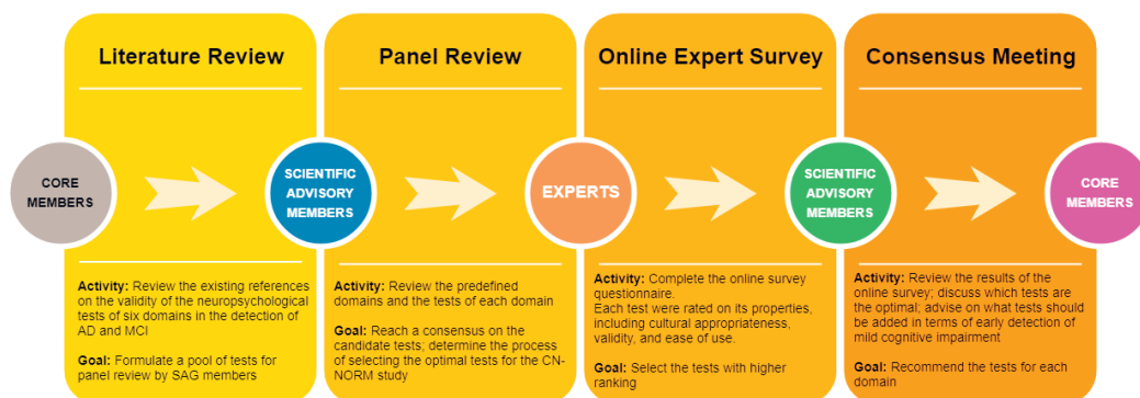
Figure 1. Flow diagram for reaching the consensus on the neurocognitive outcomes.

The process used to reach a consensus included four phases: literature review, panel review, online expert survey, and consensus meeting (Figure 1).