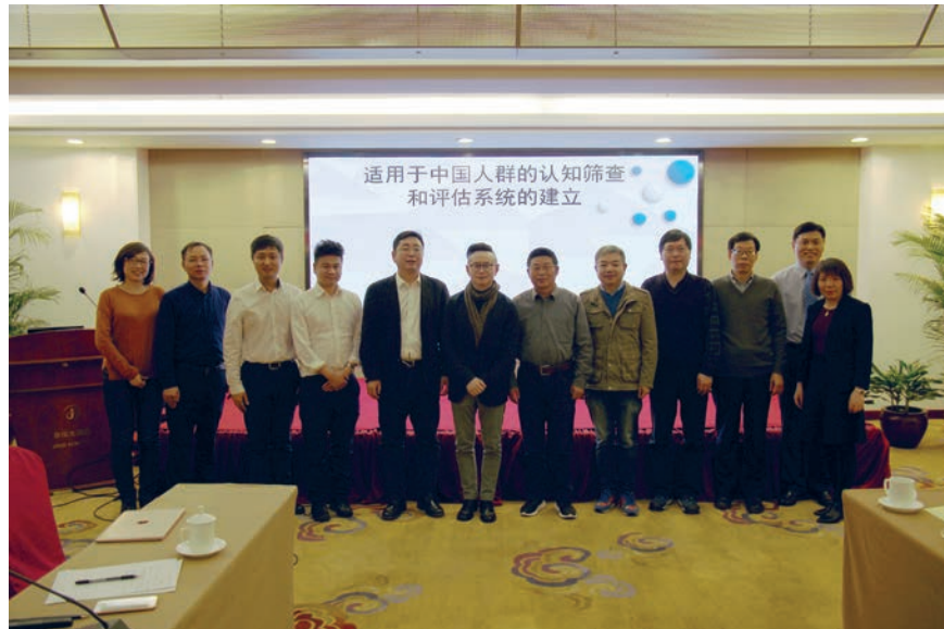
Photo: The group photo of expert panel at the consensus meeting on November 30, 2018.

horts of Chinese elders never had the opportunity to learn English; thus, they cannot complete the TMT-B. Therefore, several alternative forms of the TMT-B have been developed for Chinese individuals, eg, the shape TMT, color TMT, or black and white TMT [19-22].