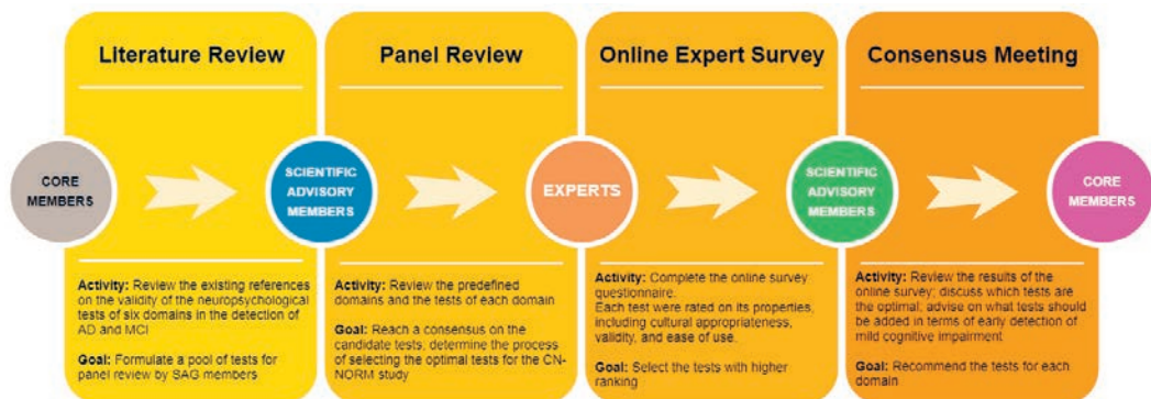
Figure 1. Flow diagram for reaching the consensus on the neurocognitive outcomes.

The process used to reach a consensus included four phases: literature review, panel review, online expert survey, and consensus meeting (Figure 1).